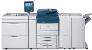
Xerox® Color C60/C70 Printer

Whether printed in full color on the Xerox® Color C60/C70 Printer, in black-and-white on the Xerox® D Series Copier/Printer or Printer, or a combination of the two, yearbooks offer new opportunities to grow your business.