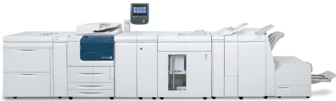
Xerox® D Series Copier/Printer