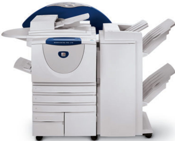
WorkCentre Pro 275 with Advanced Office Finisher (Also available in a CopyCentre and a WorkCentre model.)