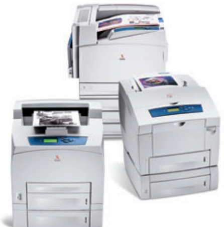
Phaser 8550, Phaser 7750, Phaser 4500

The Phaser® family of office network printers offer remarkably fast network printing at very affordable prices. And thanks to revolutionary single-pass color printing technology and amazing first-page-out time, there are few limits to what the Phaser family can do.