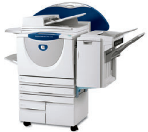
WorkCentre 245 with Basic Office Finisher (Also available in a CopyCentre and a WorkCentre Pro model.)

A new class of copier-printers from Xerox, they offer network printing, optional fax and optional email that's incredibly reliable and easy to use. Plus, color-enabled DocuColor® models let you copy, print and scan color documents when you need them. They're a great investment for budget-minded businesses that want to consolidate assets, reduce costs and improve workflow.