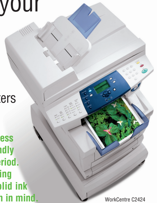
WorkCentre C2424 multifunction

with the Xerox WorkCentre® C2424 multifunction and Phaser® 8500 / 8550 printers