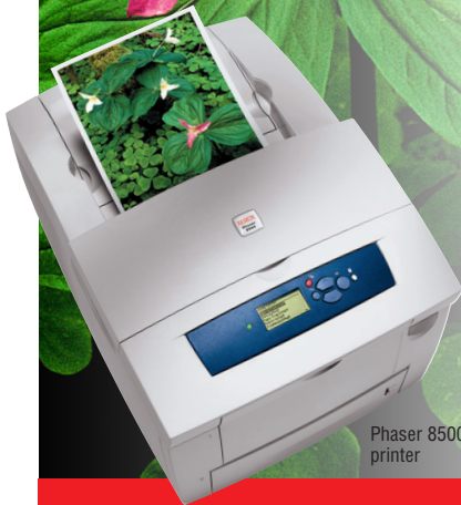
Phaser 8500 / 8550 printer