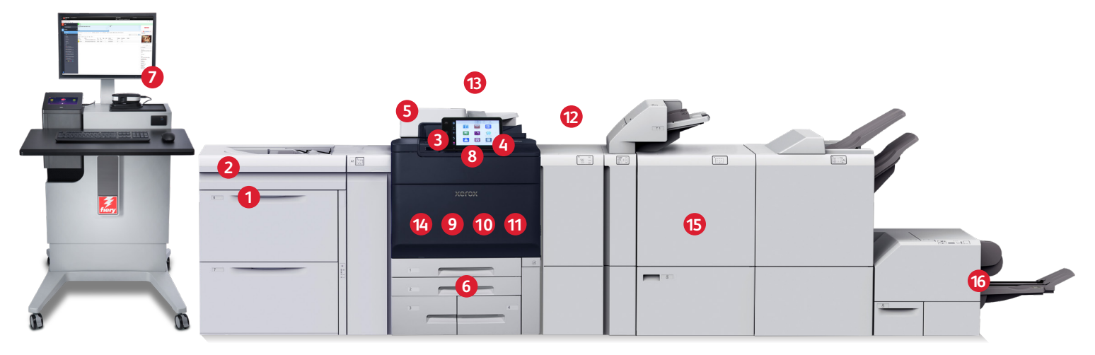
Shown: Fiery® EX Print Server, Two-tray Oversized High Capacity Feeder, Xerox® PrimeLink® C9200 Printer Series, Xerox® Crease Two-sided Trimmer, Xerox® Production Ready Booklet Maker Finisher, Xerox<sup>®</sup> SquareFold<sup>®</sup> Trimmer