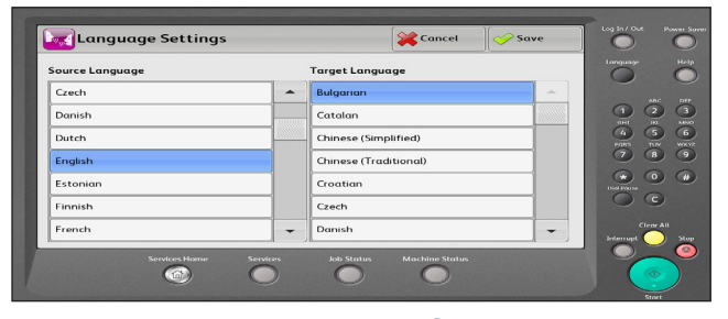
Easy Translator Service