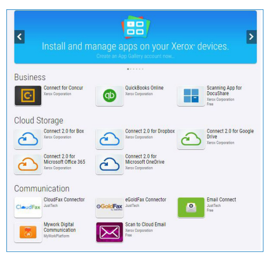
Xerox App Gallery