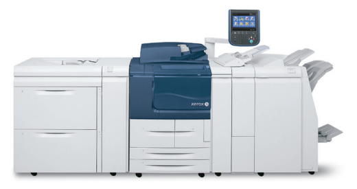
Xerox® D Series Copier/Printer