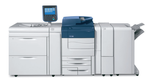
Xerox® Color C60/C70 Printer

To learn more about this unique program and how you can implement it in your institution, contact your Xerox sales representative or call 1-800-ASK-XEROX.