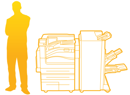
Phaser 7800 with Professional Finisher

WxDxH (DN configuration): 25.3 x 27.5 x 22.8 in. 641 x 699 x 578 mm