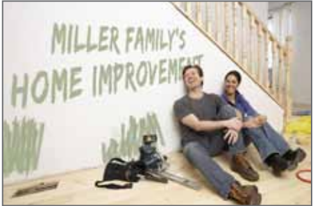
Image personalization with ulmage