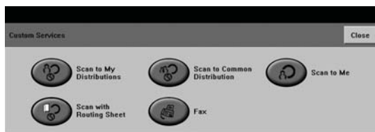
AccuRoute's Embedded Device Client enables custom buttons on the touch screen control panel on Xerox EIP-enabled MFPs.