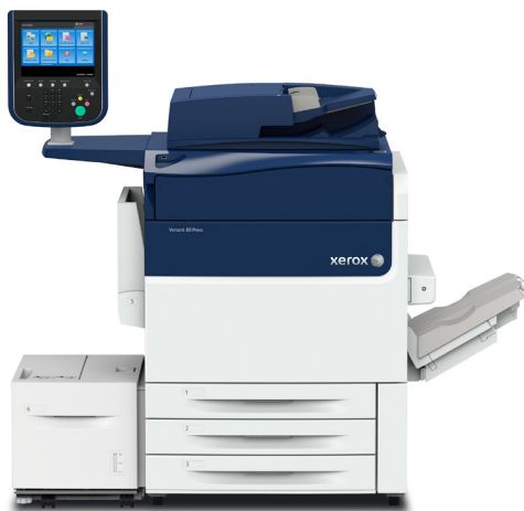
Xerox Versant 80 Press