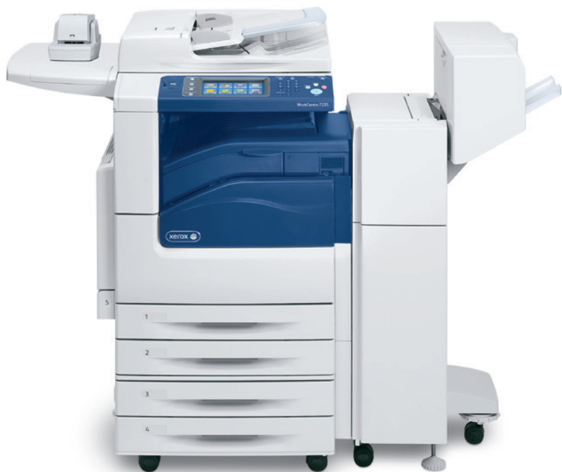
WorkCentre 7225 shown with optional Office Finisher, Booklet Maker, Convenience Stapler and Work Surface.